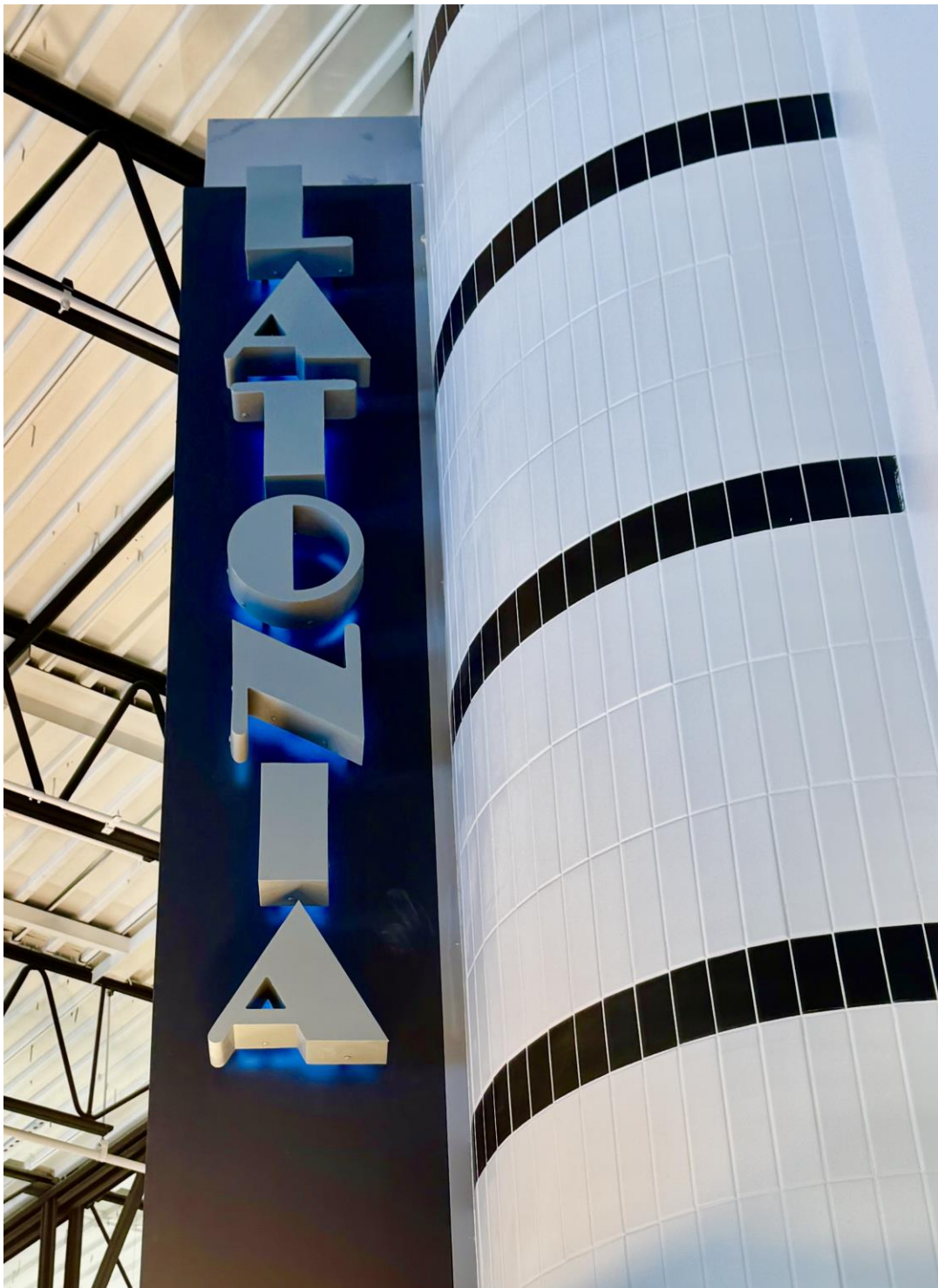
Latonia Branch 2025