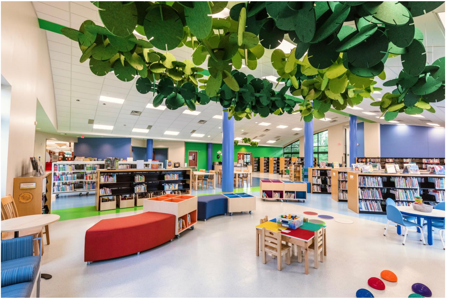
New Children's Department - Erlanger

The Kenton County Public Library has grown and prospered for more than a century. Generations of Board members and staff have dedicated their lives to enriching the people of our community with excellent library services and resources. These efforts have led to the creation of a nationally recognized system that is the pride of Kenton County.