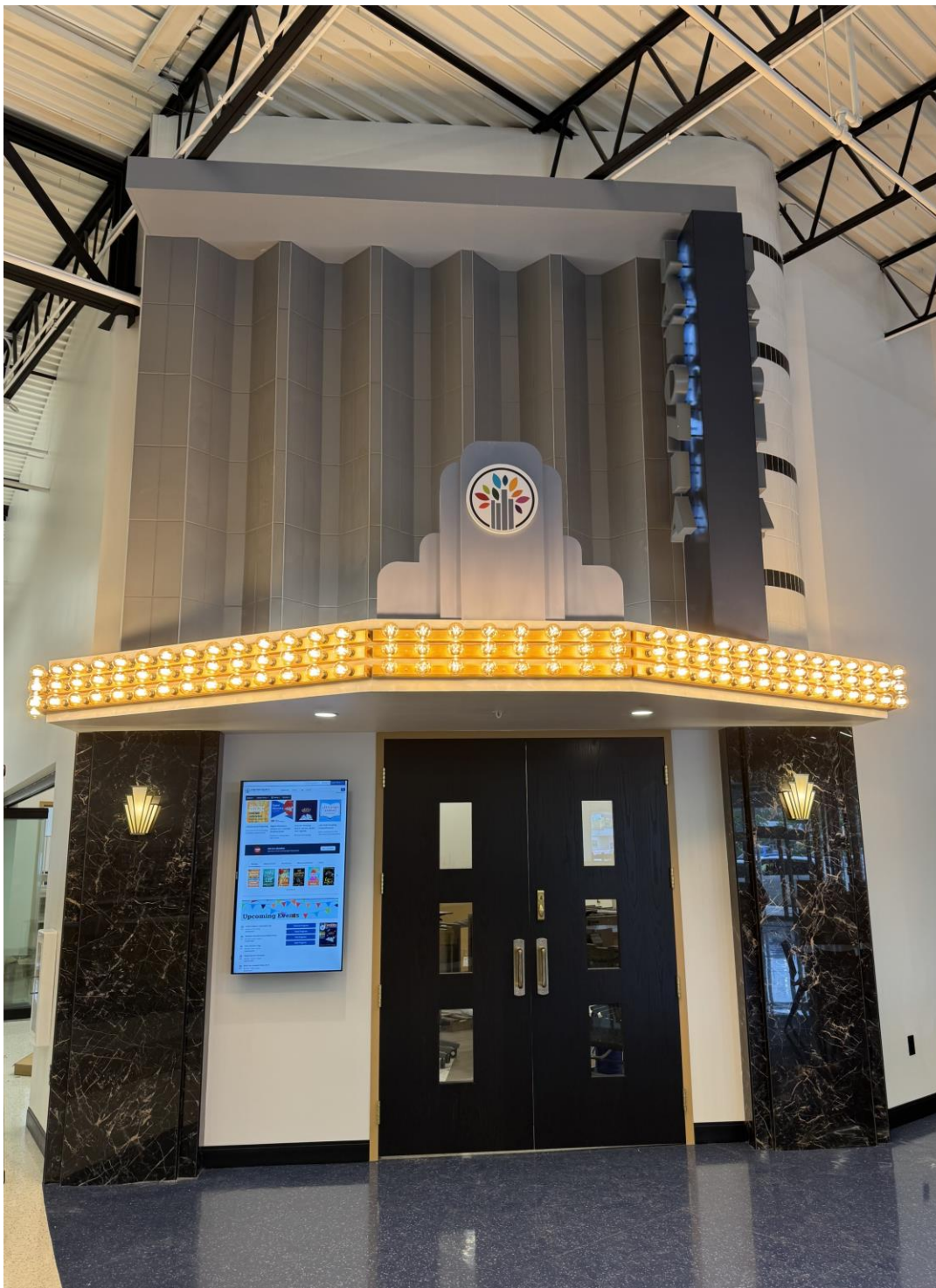
Latonia Branch 2025