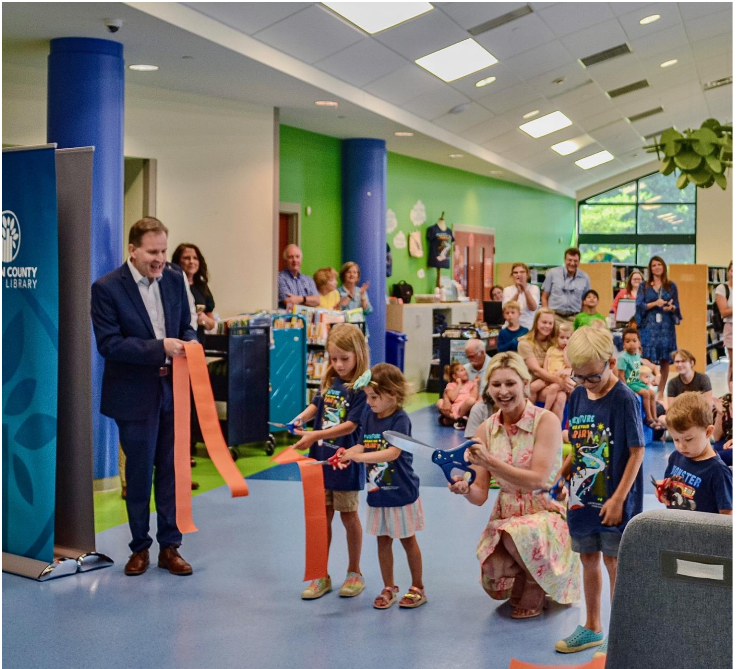
New Children's Department - Erlanger